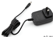
AC Wall Adapter