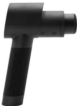
truRelief™ IMPACT Therapy™ Device MAX