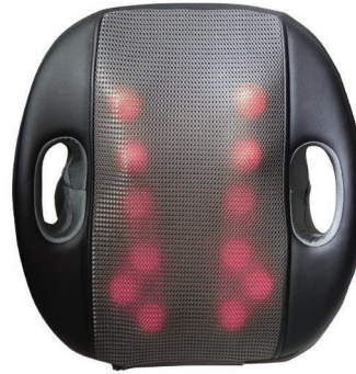
On With Heat