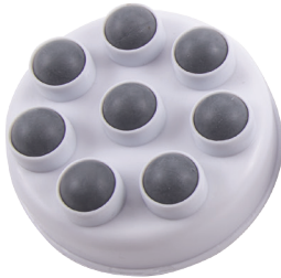
Rolling Massage Head