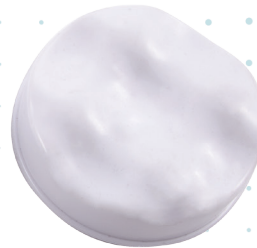
Soothing Massage Head