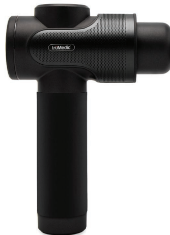
truRelief™ IMPACT Therapy™ Device PRO