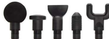
Ball, Flat, Wedge, Cylinder and Fork Massage Heads